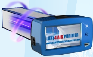
OXY 4 Purifier (ozone producing)

Whole-Home Air Purification System $899 installed