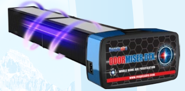
OdorMiser DTX (non-ozone producing)

System is installed in the HVAC supply duct.